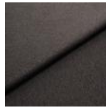
Fabric Fiesta 47 Mole 1008247