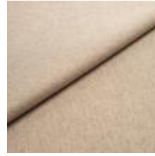
Fabric Fiesta 16 Beach 1008216