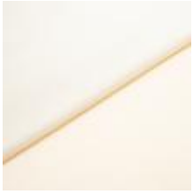
Fabric Fiesta 10 Off White 1008210