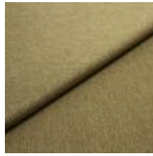
Fabric Fiesta 3 Olive 1008203