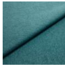
Fabric Fiesta 118 Juniper 1008242