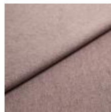
Fabric Fiesta 88 Orchid 1008281