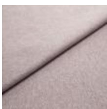
Fabric Fiesta 85 Light purple 1008291