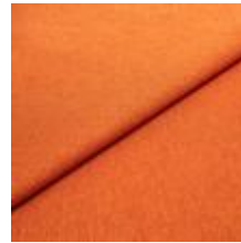
Fabric Fiesta 31 Orange 1008231