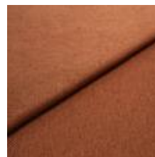
Fabric Fiesta 123 Brick 1008266