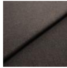
Fabric Fiesta 6 Tabacco 1008206