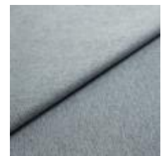
Fabric Fiesta 89 Greystoke 1008257