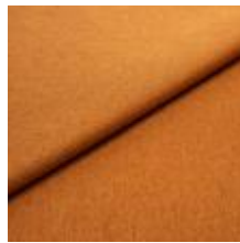
Fabric Fiesta 124 Terra 1008241