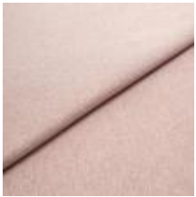
Fabric Fiesta 114 Pale rose 1008221