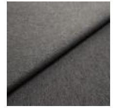
Fabric Fiesta 7 Steel 1008207