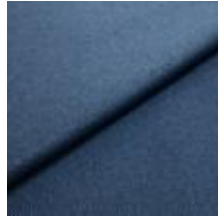
Fabric Fiesta 12 Racing Blue 69A 1008212