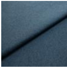
Fabric Fiesta 2 Ocean 1008202