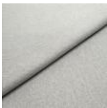
Fabric Fiesta 113 Ice 1008267