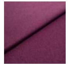
Fabric Fiesta 51 Aubergine 1008251