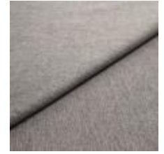
Fabric Fiesta 17 Concrete 1008217