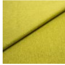
Fabric Fiesta 13 Lime 1008213