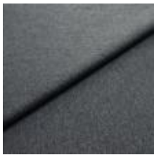
Fabric Fiesta 32 Anthracite 1008237