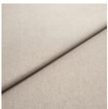
Fabric Fiesta 56 Linen 1008256