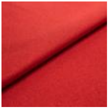
Fabric Fiesta 1 Red 1008201