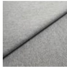
Fabric Fiesta 120 Silver melange 1008227