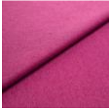
Fabric Fiesta 11 Lipstick 1008211