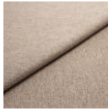
Fabric Fiesta 26 Beige melange 1008226