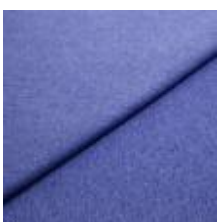
Fabric Fiesta 122 Lilac 1008261