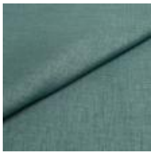
Fabric Lido 42 soda 10 1017142