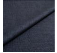
Fabric Lido trend 136 Power Blue 1017552