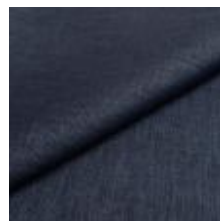
Fabric Lido trend 104 Night 1017507