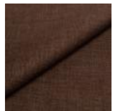
Fabric Lido trend 77 Java 1017509