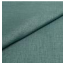
Fabric Lido 42 soda 10 1017142