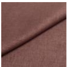
Fabric Lido trend 89 Heather 1017504