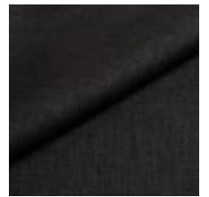
Fabric Lido trend 106 Midnight 1017503