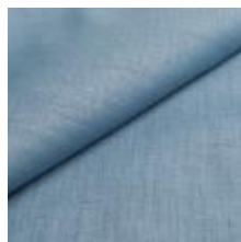
Fabric Lido trend 103 Sky 1017506