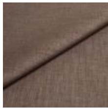
Fabric Lido 68 Dust 1017181