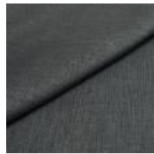
Fabric Lido trend 100 Lagoon 1017502