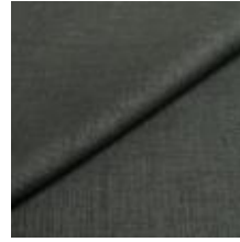
Fabric Lido trend 142 Gale 1017550