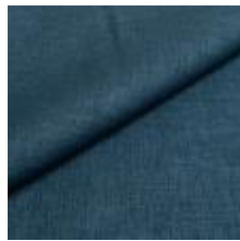
Fabric Lido 121 Blue 1017183