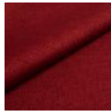
Fabric Lido trend 84 Brick 1017501