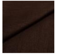
Fabric Lido 6 coffee 26 1017106