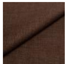
Fabric Lido trend 77 Java 10 1017509