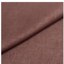
Fabric Lido trend 89 Heather 10 1017504