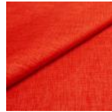
Fabric Lido trend 81 Orange 1017514