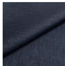
Fabric Lido trend 104 Night 10 1017507