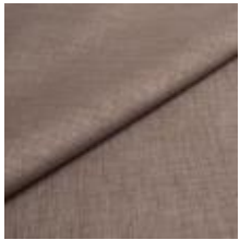
Fabric Lido 17 concrete 19 1017117