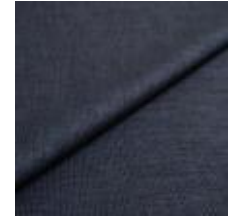
Fabric Lido trend 136 Power Blue 1017552