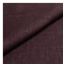
Fabric Lido trend 144 Thistle 1017544