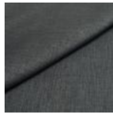
Fabric Lido trend 100 Lagoon 10 1017502