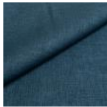
Fabric Lido 121 Blue 10 1017183