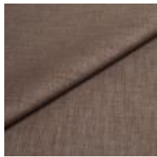
Fabric Lido 68 Dust 10 1017181