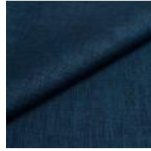
Fabric Lido 12 Ocean 54 1017112