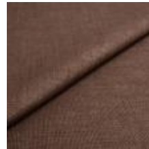
Fabric Lido trend 76 Havana 1017525