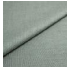
Fabric Lido trend 93 Aqua 1017524