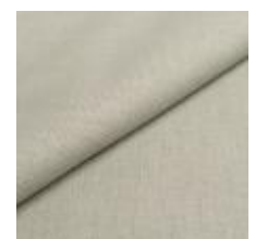
Fabric Lido trend 143 Mint 1017546