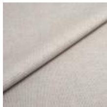
Fabric Lido trend 132 Toned 1017530