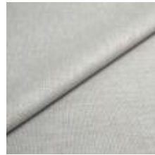
Fabric Lido 27 silver 40 1017127