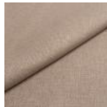
Fabric Lido trend 131 Quartz 1017531