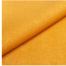
Fabric Lido trend 80 Curry 1017517