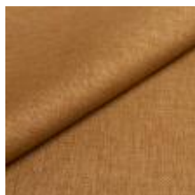
Fabric Lido trend 155 Lemongrass 1017536