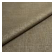
Fabric Lido trend 134 Antique green 1017537