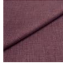
Fabric Lido trend 90 Violet 1017520