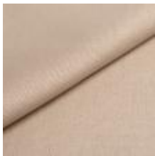
Fabric Lido trend 161 Soft sand 1017529