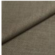
Fabric Lido trend 95 Mineral 1017523