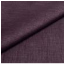
Fabric Lido trend 91 Purpur 1017510