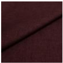
Fabric Lido 71 plum 18 1017171