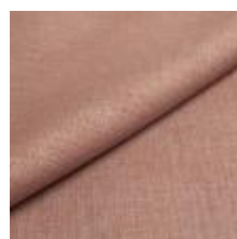
Fabric Lido trend 148 Orchid 1017543