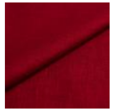
Fabric Lido 61 wine 16 1017161