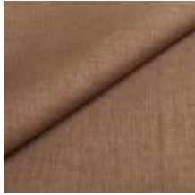
Fabric Lido trend 71 Desert 1017516