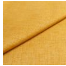
Fabric Lido 5 Sun 48 1017105