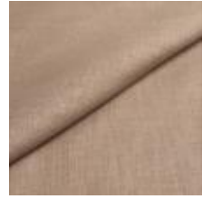
Fabric Lido 16 beige 04 1017116