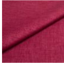
Fabric Lido 11 pink 07 1017111