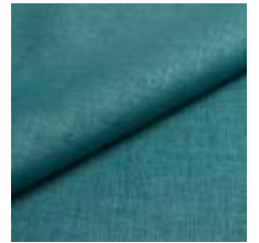
Fabric Lido 32 turquoise 12 1017132