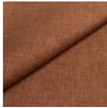
Fabric Lido trend 72 Latte 1017511