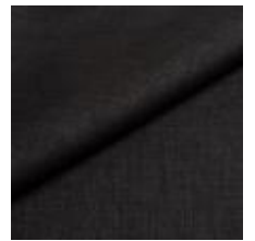
Fabric Lido trend 106 Midnight 10 1017503