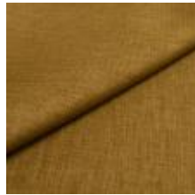
Fabric Lido 23 olive 13 1017123