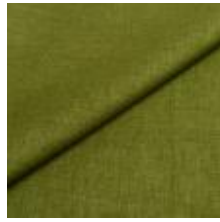
Fabric Lido 3 green 14 1017103