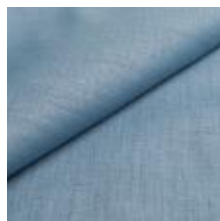
Fabric Lido trend 103 Sky 10 1017506