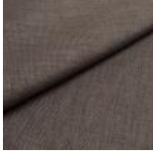
Fabric Lido trend 129 Savile grey 1017554