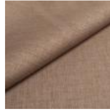
Fabric Lido trend 70 Linen 1017519