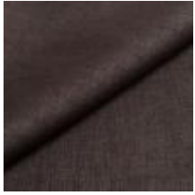
Fabric Lido 7 graphite 21 1017107