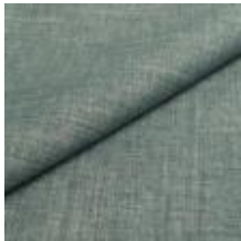
Fabric Lido trend 99 Crystal 1017522