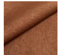
Fabric Lido trend 156 Onion 1017534