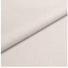
Fabric Lido trend 133 Ice White 1017553