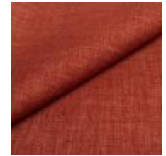
Fabric Lido trend 85 Rust 1017515