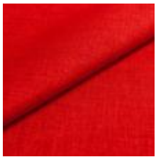
Fabric Lido 41 tulip 08 1017141