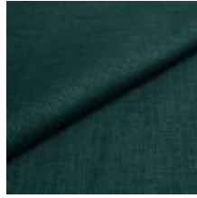
Fabric Lido trend 137 Wave 1017549