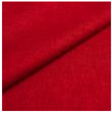
Fabric Lido 1 Red 15 1017101