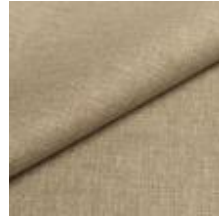
Fabric Lido trend 96 Bright green 1017518