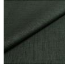
Fabric Lido trend 140 Storm 1017551