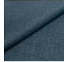
Fabric Lido trend 102 Pacific 1017521