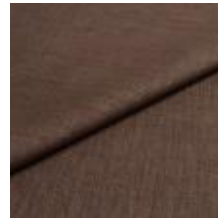
Fabric Lido trend 75 Fog 1017513