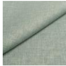
Fabric Lido trend 98 Glass 1017512