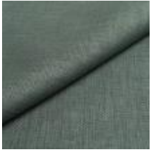
Fabric Lido trend 141 Cyan 1017547