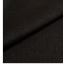
Fabric Lido trend 126 Onyx 1017556