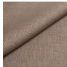
Fabric Lido trend 130 Pelican 1017532