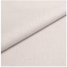
Fabric Lido trend 133 Ice White 1017553