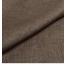
Fabric Lido trend 128 Typhoon 1017555