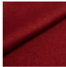
Fabric Lido trend 84 Brick 10 1017501