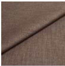
Fabric Lido 68 Dust 10 1017181