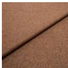
Fabric Margrethe 710037 Brandy 1020628