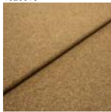
Fabric Margrethe 23162114 Amber 1020622