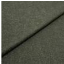
Fabric Margrethe 721010 Bottle green 1020619