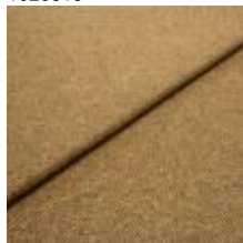
Fabric Margrethe 23162114 Amber 1020622