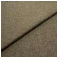
Fabric Margrethe 711010 Avocado 1020621