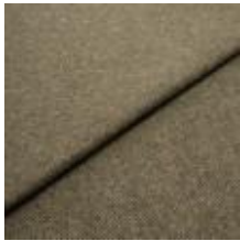
Fabric Margrethe 711010 Avocado 1020621