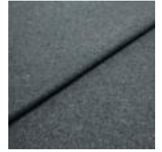
Fabric Margrethe 22800706 Marine melange 1020615