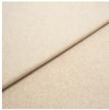
Fabric Margrethe 1 Sand 1020601