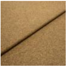
Fabric Margrethe 23162114 Amber 1020622