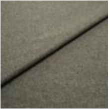
Fabric Margrethe 722318 Dusty green 1020618