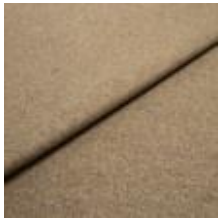
Fabric Margrethe 6 Bronze 1020602