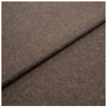
Fabric Margrethe 15 Dark brown 1020603