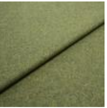
Fabric Margrethe 10 Green 1020605