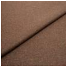
Fabric Margrethe 720037 Rusty 1020627