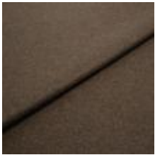
Fabric Margrethe 21141010 Java 1020629