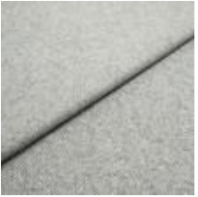
Fabric Margrethe 2 Silver melange 1020611