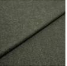
Fabric Margrethe 721010 Bottle green 1020619