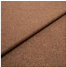
Fabric Margrethe 710037 Brandy 1020628