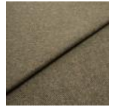
Fabric Margrethe 711010 Avocado 1020621