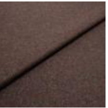
Fabric Margrethe 22800037 Wine melange 1020625