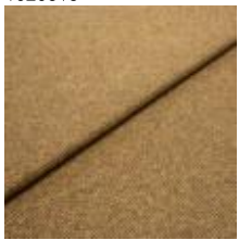
Fabric Margrethe 23162114 Amber 1020622