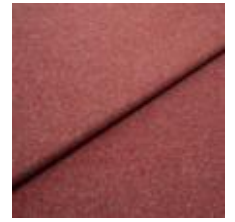
Fabric Margrethe 8 Aubergine 1020608