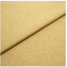
Fabric Margrethe 9 Bright green 1020604