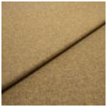
Fabric Margrethe 23162267 Umber 1020623