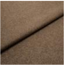
Fabric Margrethe 712114 Dark taupe 1020630