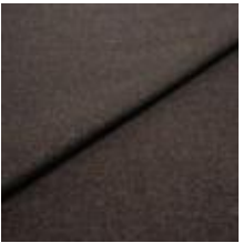
Fabric Margrethe 22802114 Night 1020624