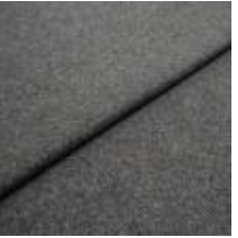
Fabric Margrethe 16 Anthracite 1020613