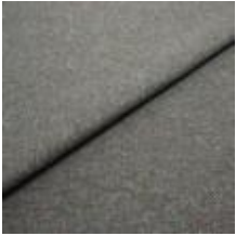
Fabric Margrethe 4 Petrol 1020609