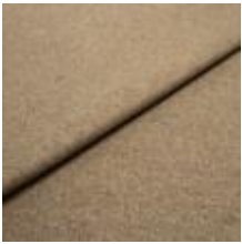
Fabric Margrethe 6 Bronze 1020602