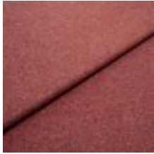
Fabric Margrethe 8 Aubergine 1020608