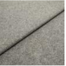
Fabric Margrethe 13 Stone 1020612