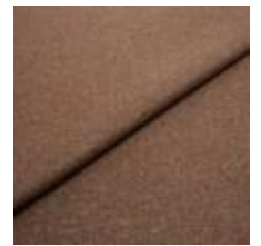
Fabric Margrethe 720037 Rusty 1020627