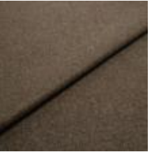
Fabric Margrethe 722114 Barque 1020620