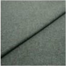
Fabric Margrethe 21140082 Lagoon melange 1020616