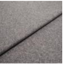
Fabric Margrethe 12 Violet 1020606