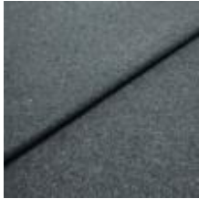
Fabric Margrethe 22800706 Marine melange 1020615