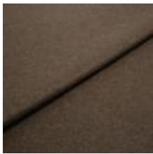
Fabric Margrethe 21141010 Java 1020629