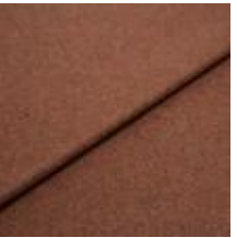
Fabric Margrethe 21140037 Brick 1020626