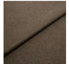
Fabric Margrethe 722114 Barque 1020620