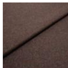
Fabric Margrethe 22800037 Wine melange 1020625