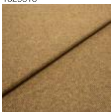
Fabric Margrethe 23162114 Amber 1020622