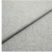
Fabric Margrethe 2 Silver melange 1020611