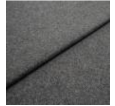
Fabric Margrethe 16 Anthracite 1020613