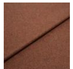
Fabric Margrethe 21140037 Brick 1020626