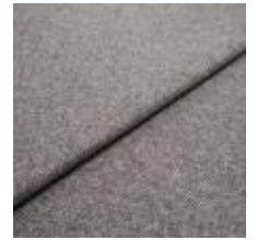
Fabric Margrethe 12 Violet 1020606