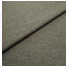
Fabric Margrethe 722318 Dusty green 1020618