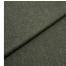
Fabric Margrethe 721010 Bottle green 1020619