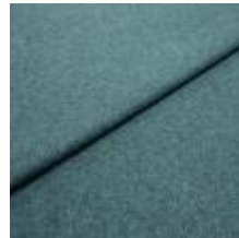
Fabric Margrethe 22800082 Pacific 1020617