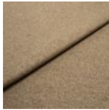
Fabric Margrethe 6 Bronze 1020602