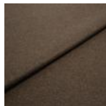
Fabric Margrethe 21141010 Java 1020629