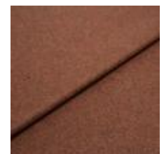
Fabric Margrethe 21140037 Brick 1020626