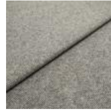
Fabric Margrethe 13 Stone 1020612