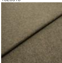
Fabric Margrethe 711010 Avocado 1020621