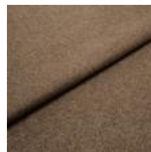
Fabric Margrethe 712114 Dark taupe 1020630