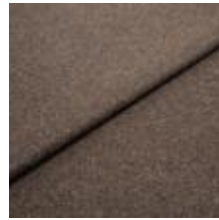
Fabric Margrethe 15 Dark brown 1020603