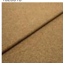
Fabric Margrethe 23162114 Amber 1020622