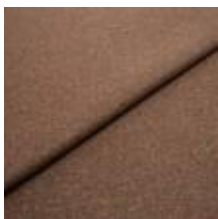
Fabric Margrethe 720037 Rusty 1020627