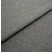
Fabric Margrethe 4 Petrol 1020609