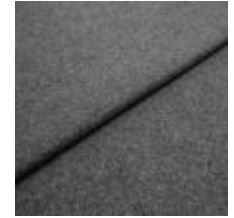
Fabric Margrethe 16 Anthracite 1020613