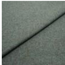
Fabric Margrethe 21140082 Lagoon melange 1020616