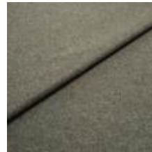
Fabric Margrethe 722318 Dusty green 1020618