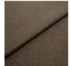
Fabric Margrethe 722114 Barque 1020620