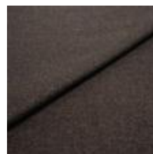
Fabric Margrethe 22802114 Night 1020624