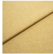
Fabric Margrethe 9 Bright green 1020604