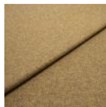
Fabric Margrethe 23162267 Umber 1020623