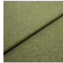
Fabric Margrethe 10 Green 1020605