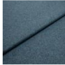
Fabric Margrethe 14 Ocean 1020610