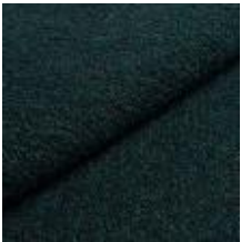
Fabric Barnum 20 Petrol