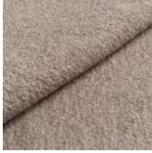
Fabric Barnum 3 Hemp 1025009