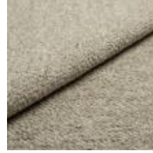
Fabric Barnum 2 Sand 1025012