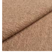
Fabric Barnum 4 Juta 1025011