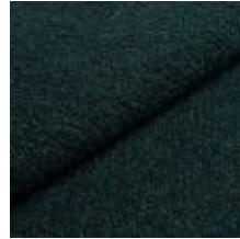
Fabric Barnum 20 Petrol 1025017