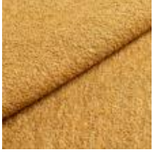
Fabric Barnum 5 Ocher 1025008