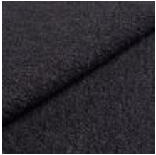
Fabric Barnum 19 Ocean 1025014