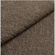
Fabric Barnum 8 Medium green