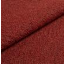
Fabric Barnum 23 Rust