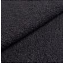
Fabric Barnum 19 Ocean