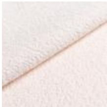
Fabric Barnum 1 Off White