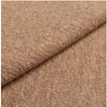
Fabric Barnum 4 Juta