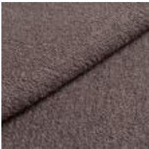
Fabric Barnum 12 Warm grey