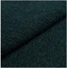
Fabric Barnum 20 Petrol