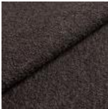
Fabric Barnum 13 Anthracite