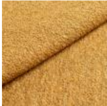
Fabric Barnum 5 Ocher