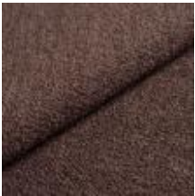
Fabric Barnum 11 Brown