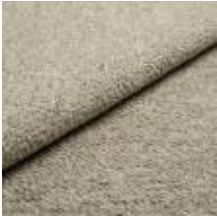
Fabric Barnum 2 Sand