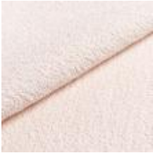
Fabric Barnum 24 Lana