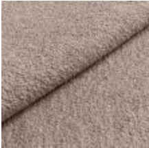
Fabric Barnum 3 Hemp