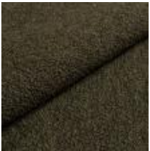
Fabric Barnum 9 Pine