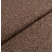
Fabric Barnum 10 Dark taupe