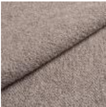
Fabric Barnum 14 Silver