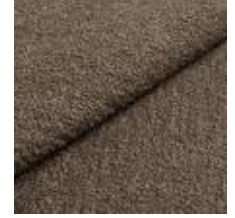
Fabric Barnum 8 Medium green 1025013