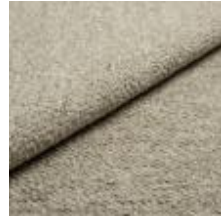
Fabric Barnum 2 Sand 1025012