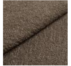
Fabric Barnum 8 Medium green 1025013