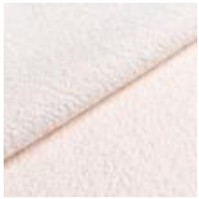
Fabric Barnum 1 Off White 1025001