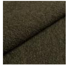
Fabric Barnum 9 Pine 1025007