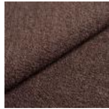
Fabric Barnum 11 Brown 1025005