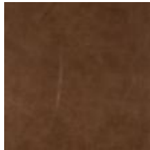
Leather Vintage Tabacco 1100431