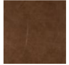
Leather Vintage Tabacco 1100431