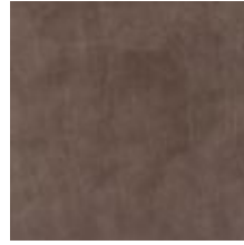
Leather Vintage Concrete 1100429