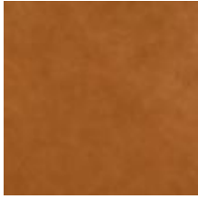
Leather Vintage Cognac 1100413