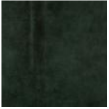
Leather Vintage Bottle Green Soft Anilina 1100424