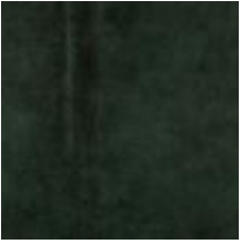
Leather Vintage Bottle Green Soft Anilina 1100424