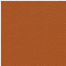
Leather Prescott SA 223 Swamp 1110178