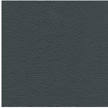
Leather Prescott SA 211 Greyshadow 1110265