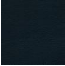
Leather Prescott SA 207 Black Ink 1110266