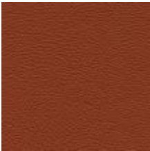
Leather Prescott SA 289 Hezelnut 1110180