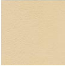
Leather Prescott SA 292 Caffelatte 1110331