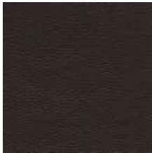
Leather Prescott SA 231 Chestnut 1110221