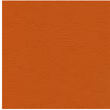
Leather Prescott SA 252 Volcano 1110333