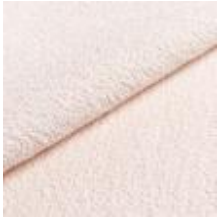
Fabric Barnum 24 Lana 1025015