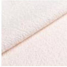
Fabric Barnum 1 Off White 1025001