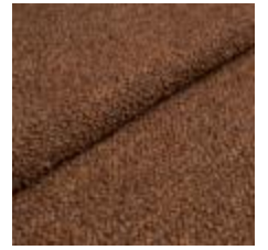
Fabric Barnum 21 Rustic 1025023