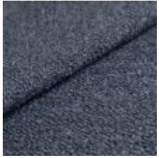
Fabric Barnum 16 Indigo 1025024