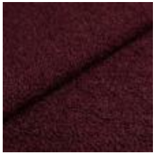
Fabric Barnum 29 Burgundy 1025018