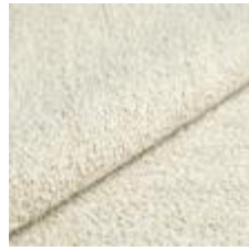
Fabric Barnum 101 Linen 1025022