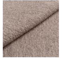
Fabric Barnum 3 Hemp 1025009