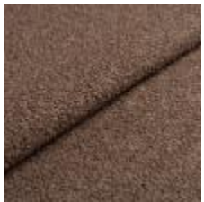
Fabric Barnum 10 Dark taupe 1025010