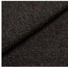
Fabric Barnum 30 Shale 1025019