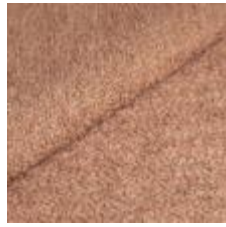
Fabric Barnum 27 Rose 1025020