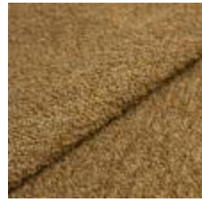
Fabric Barnum 28 Fudge 1025021