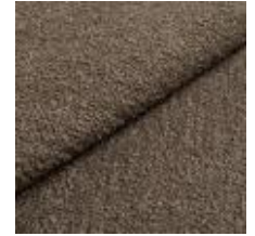
Fabric Barnum 8 Medium green 1025013