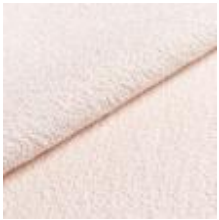
Fabric Barnum 24 Lana 1025015