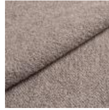
Fabric Barnum 14 Silver 1025006